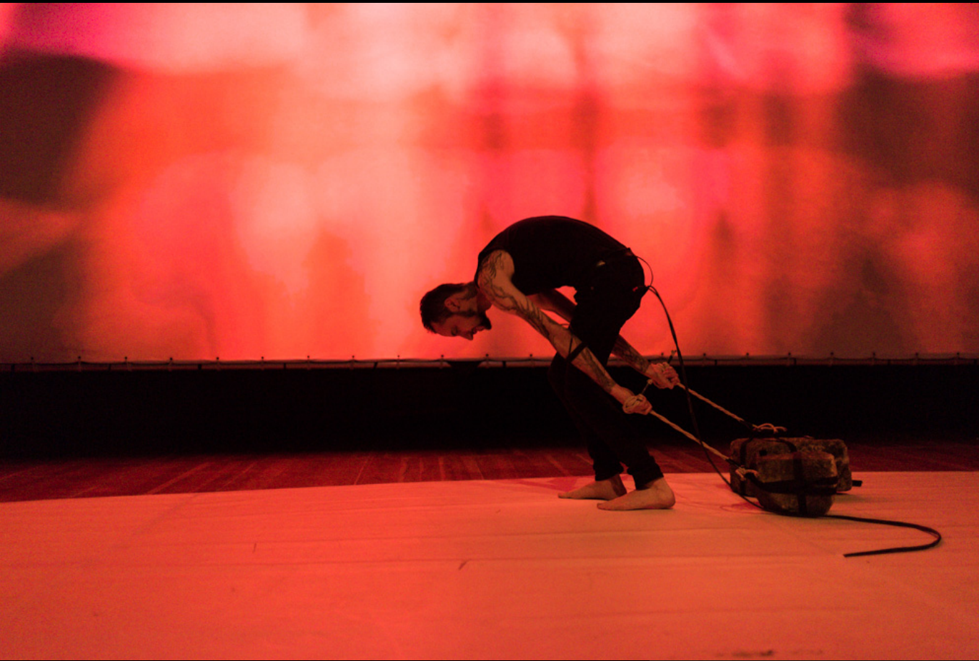
Hypo Chrysos, 2013

Xth Sense, biophysical sensors gather data from pulse, blood flow, and muscle activity