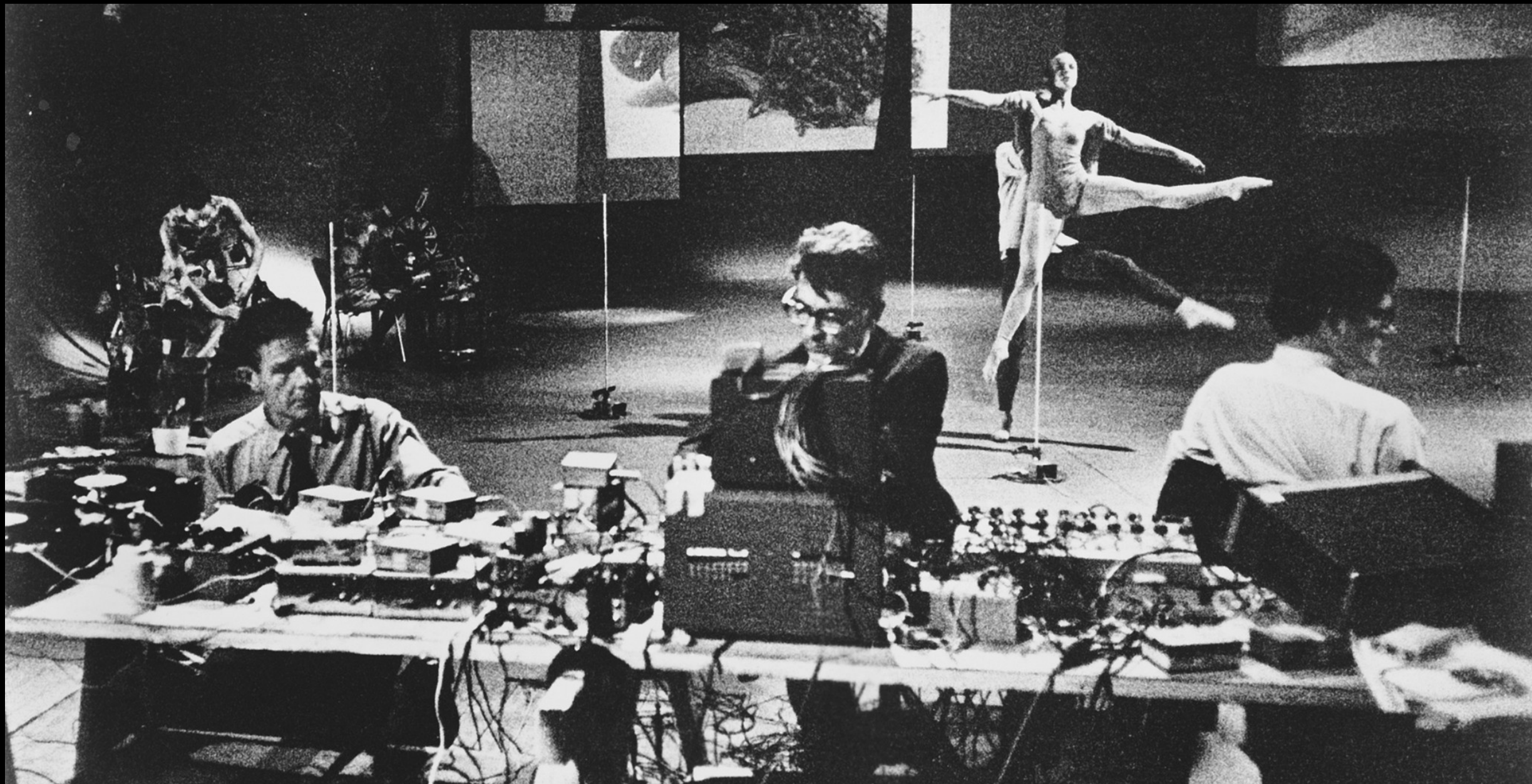
John Cage & Merce Cunningham, Variations V