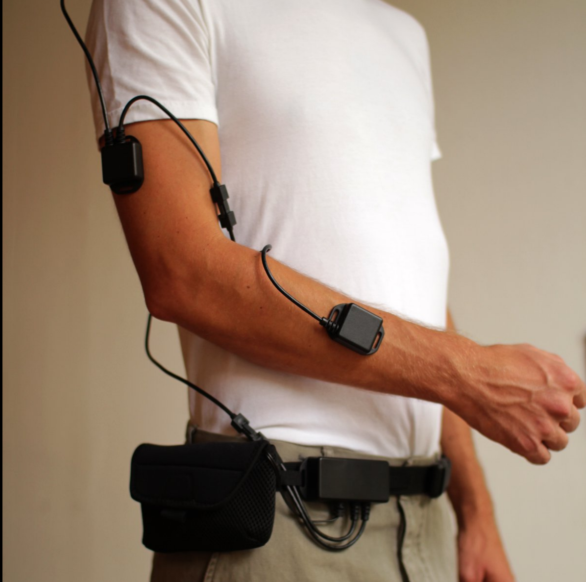
MotionNode (inertia measurement unit)